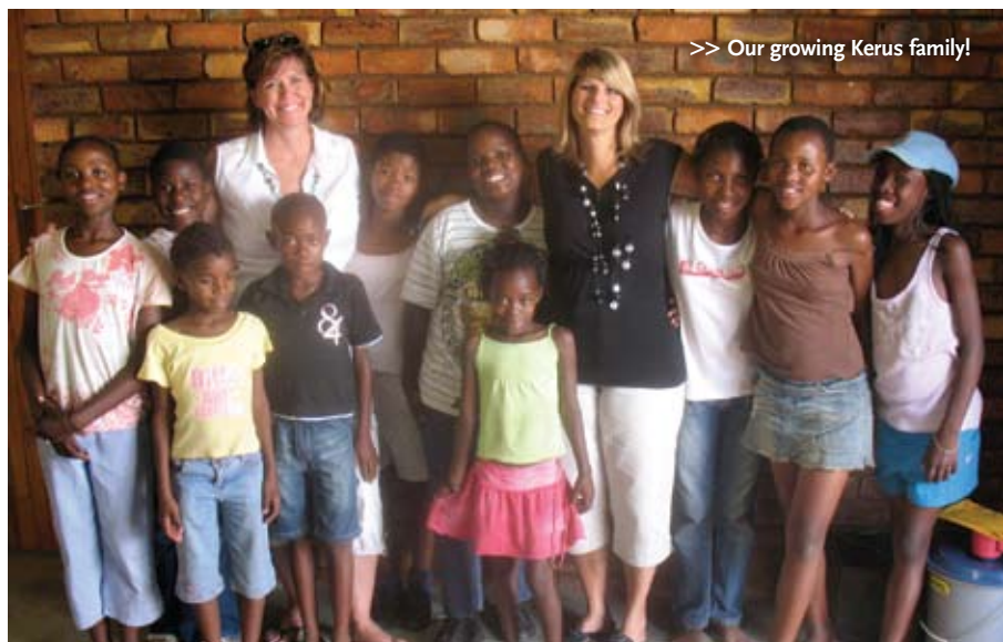
>> Our growing Kerus family!

In response to this call to compassion, Kerus opened and dedicated a new orphan care center in 2008. With our local partner, Acts2Change, and township churches and schools, Kerus is working to transform the community of Soshanguve. Today, over 50 children receive care daily in the center, including a nutritious meal, a safe place to play, medical care, tutoring for their schoolwork, and spiritual development training that will help them chart a positive course for their lives. All of the children attend school and live with caring adults in the community. Kerus Orphan Care Center exists to assist these primary caregivers.