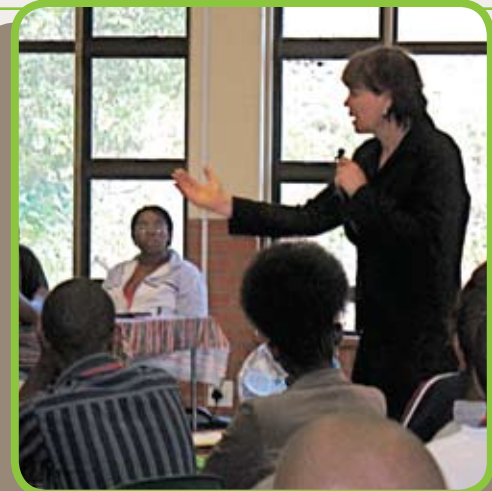
>> It Takes Courage! training comes to Zambia.