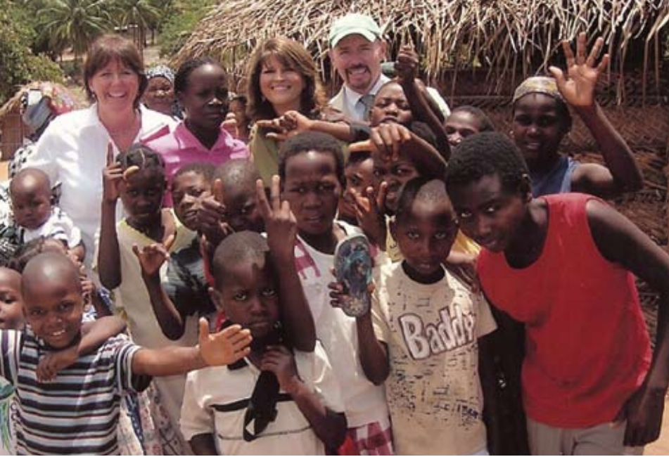
Mozambique >> A village of excited children after an It Takes Courage! training.

This all comes, of course, at a cost. I spend one month every year away from family. Strange places, strange food, and often accommodations that are less than four-star. Why is it worth it? Once, as a young medical student, I heard a missionary physician speak about the high personal price she had paid over her years of service in Africa. She said that, when people asked her about the cost of it all, she simply replied, "The cost is swallowed up in privilege." That expresses my own heart when it comes to Kerus. I remain, ten years later, overwhelmed by the privilege. ✿