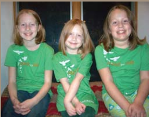
Give a Shirt >> Change a Life!

Visit the Kerus website to learn more about the new orphan care center.